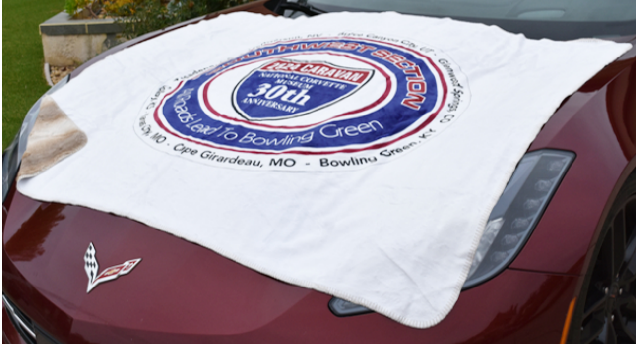
This is the 2024 Caravan Stadium Blanket.