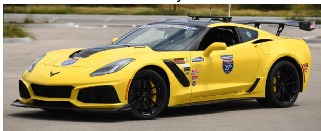
Sandy's and Hib's 2019 ZR1/ZTK The Last Great Front Engine Corvette