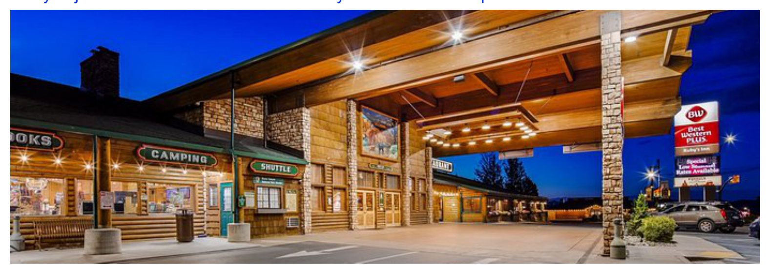
One of the three Best Western hotels that make up the Ruby's Inn complex.

A key objective of PreRun6 was to visit Ruby's Inn for a site inspection.